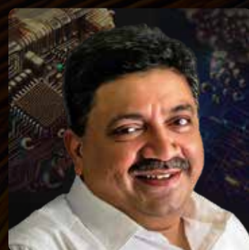
Dr Palanivel Thiaga Rajan Minister for Information Technology & Digital Services Tamil Nadu